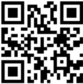
Twitter : CPGKFUPM