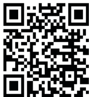
Linkdin : CPG-CLUB